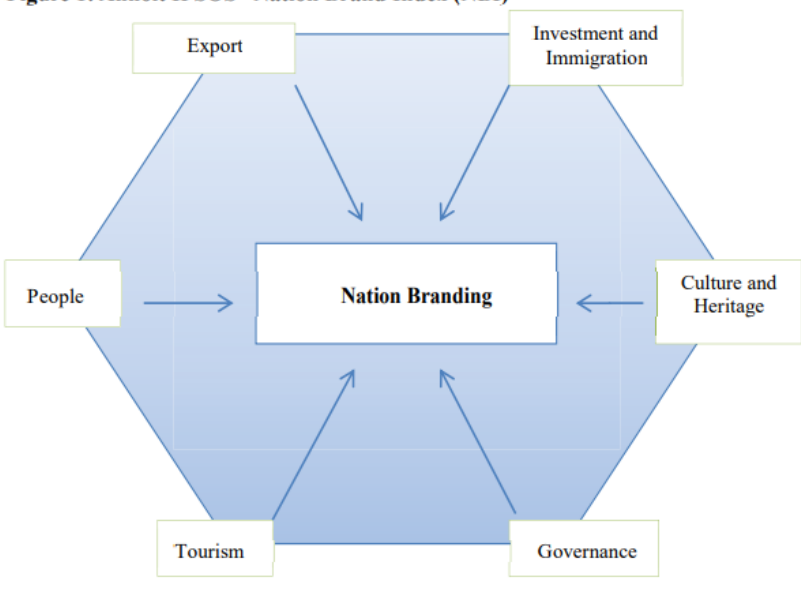
Figure 1: Anholt IPSOS48 Nation Brand Index (NBI)49

all the reviewed studies depended on the Anholt model of nation branding hexagon that identifies six main elements in any nation branding initiative, including export, investment and immigration, people, culture and heritage, Governance and tourism. (Sajid Karim Mohammad Jasim Uddin,2021)